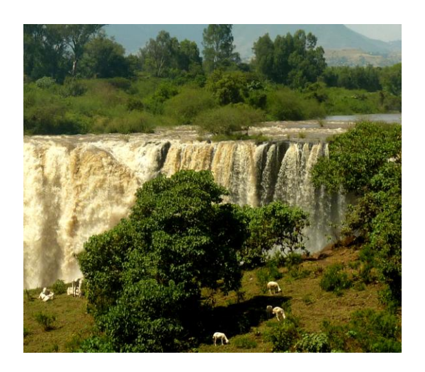
they can be observed from several viewpoints, including a marvellous 'swinging' metal bridge, which may be a bit scaring yet offers a unique perspective.