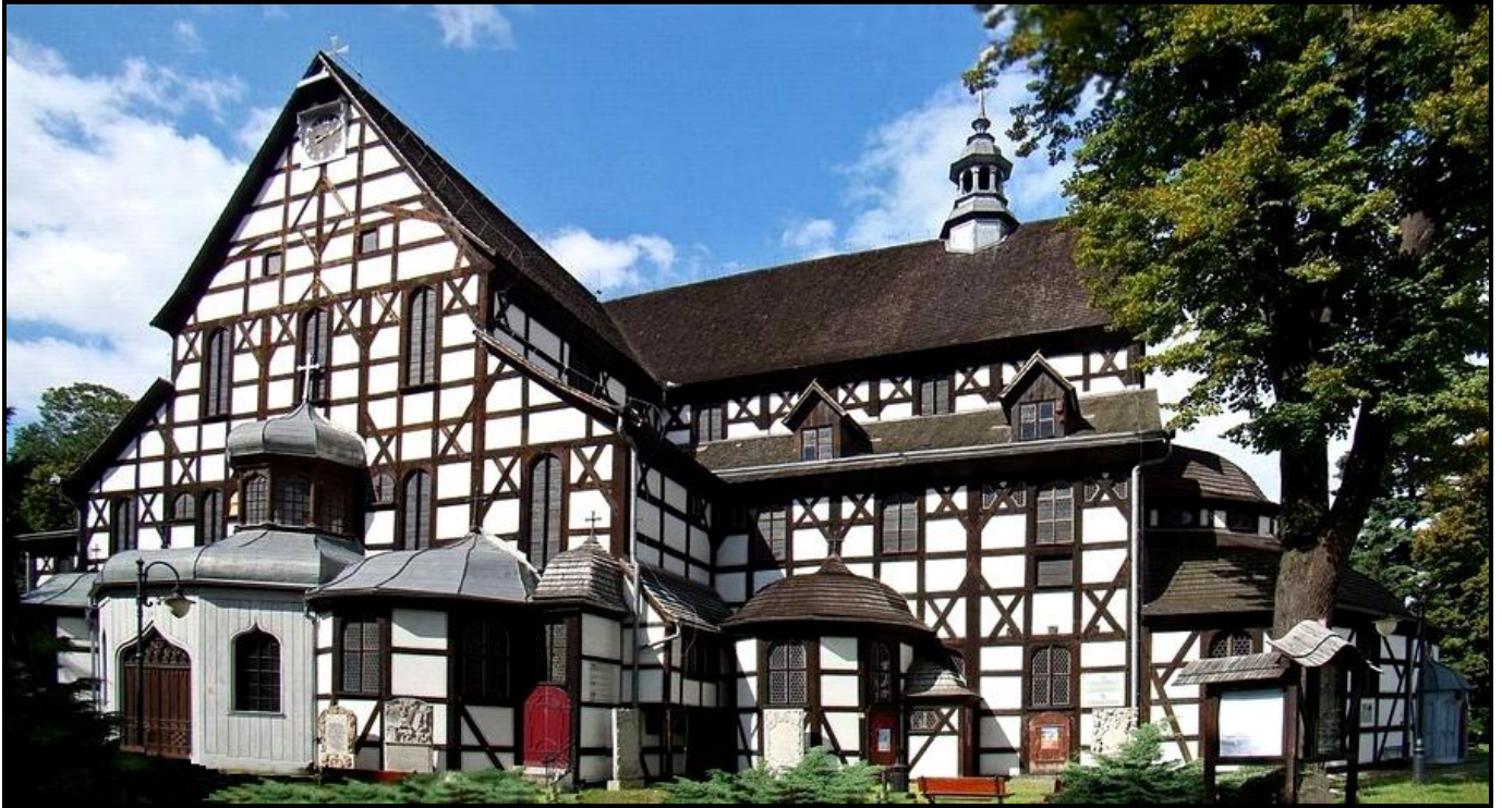
Friedenskirche ~ Peace Church (World Heritage Monument)