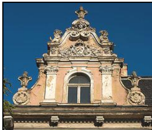
Schweidnitz - old town