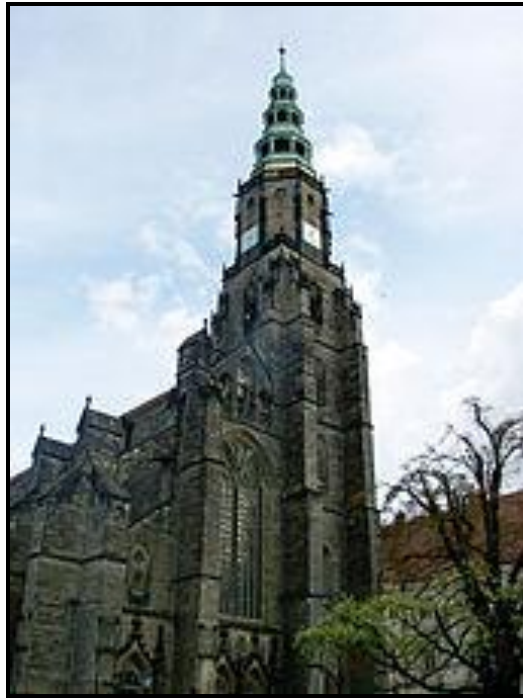
Catholic "Pfarrkirche St. Stanislaus & Wenzel"