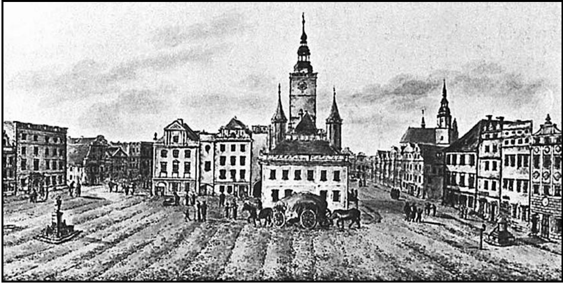
Central place & Townhall - Historic view