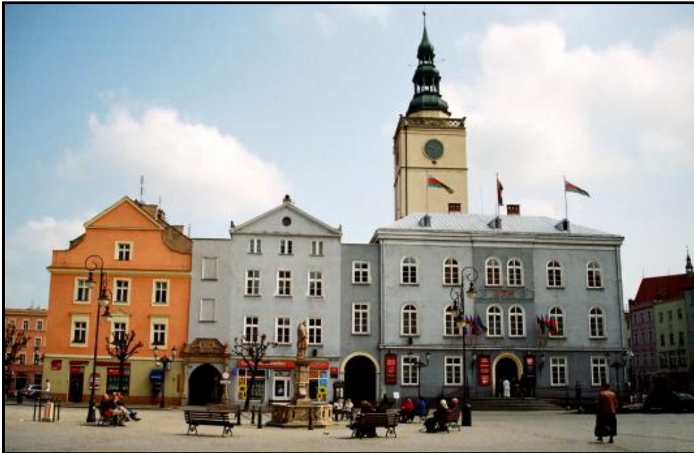
Central place & Townhall - Current view