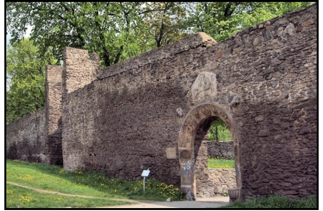
Old Citywalls - some on a slight hill (where B.R. 1944 learned skiing)