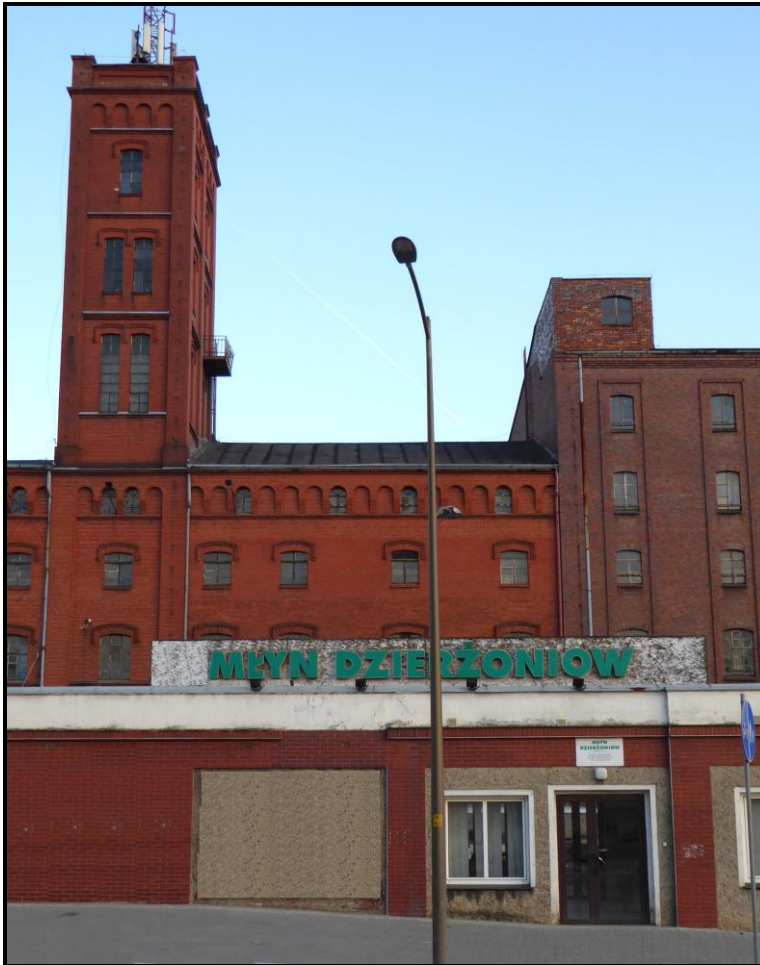
Mill/Młyn (where B.R.senior was employed 1940-45)