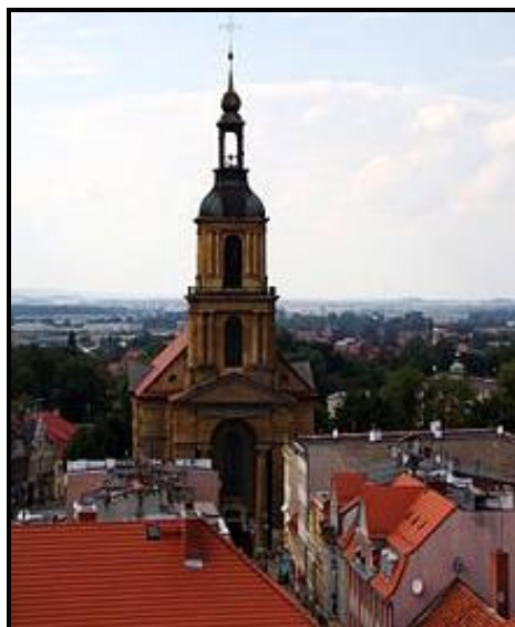
Protestant church "Maria Mutter der Kirche"