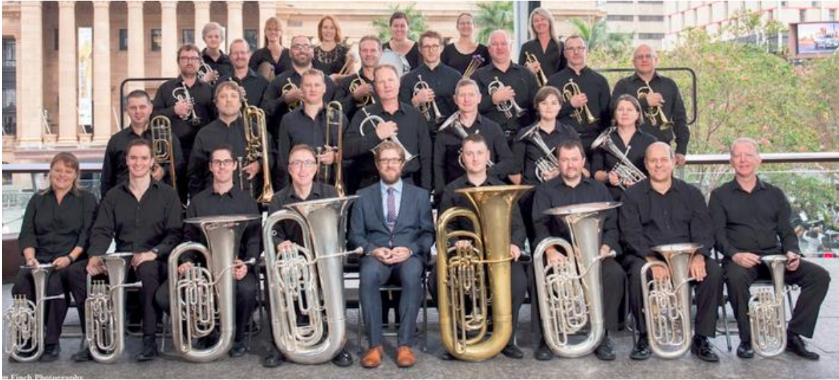
And here is my right now favourite band, the “City Marching Band” from Warrnambool!