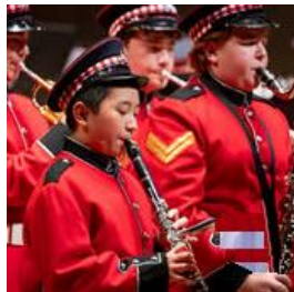
By far the largest, supposedly best, and widely performing, even in concert halls, is the “Air Force Band Australia”.